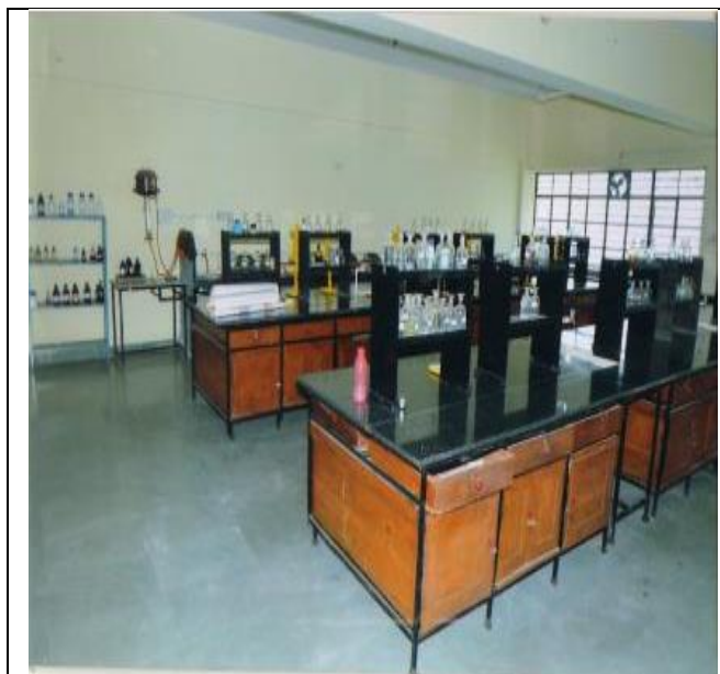
Applied Science Lab (Chemistry Lab)