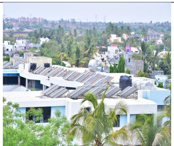
Solar Panel on Hostel