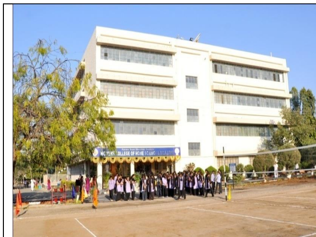
Institute Main Building

4.1.1 The institution has adequate facilities for teaching-learning. viz., classrooms, Laboratories, computing equipment, etc.