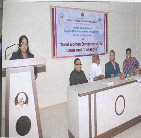
Introductory speech regarding seminar

[Signature] Principal Women's College of Home Science and BCA At/Po. Loni Tal. Rahata, Dist. Ahmednagar Pin. 413713